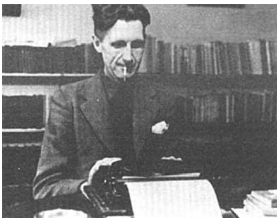
Figure 2 George Orwell smoking