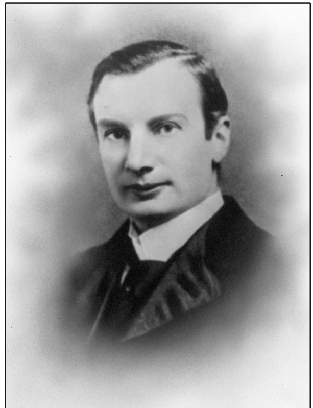
Figure 1 Dr Waldemar Mordecai Haffkine

istics of protozoans and, in 1884, he successfully defended his thesis for the degree of doctor of science. Debarred from a professorship because of